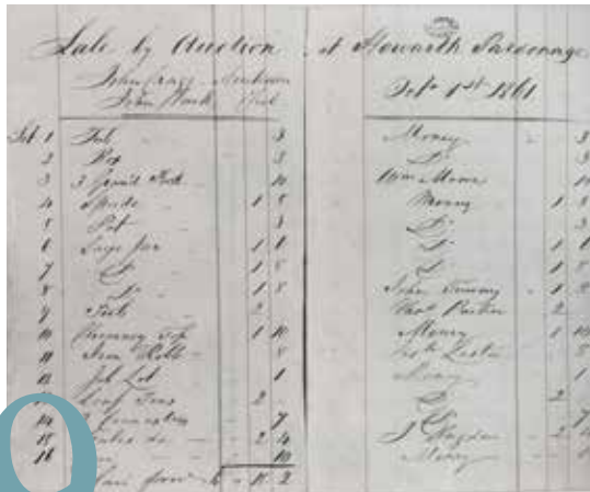
Haworth Parsonage Sale Catalogue 1861

an auction which took place on 1st and 2nd October 1861.